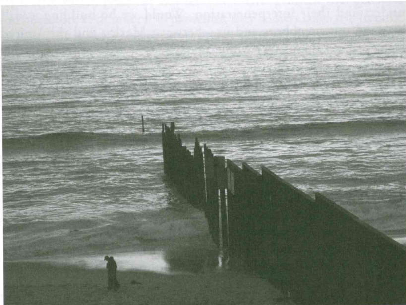
Fig 1: U.S./Mexico Wall at the Pacific Ocean, Tijuana/San Diego

Our United States' "Berlin Wall" has affinity with other such walls. Standing on the parched earth looking south toward Tijuana across the wall, for a moment you might think you are in Israel or the Palestinian-occupied territories. The same kind of bright yellow equipment constructed the Israeli separation wall that is strangling the Palestinian settlements and refugee camps. Caterpillar is the same