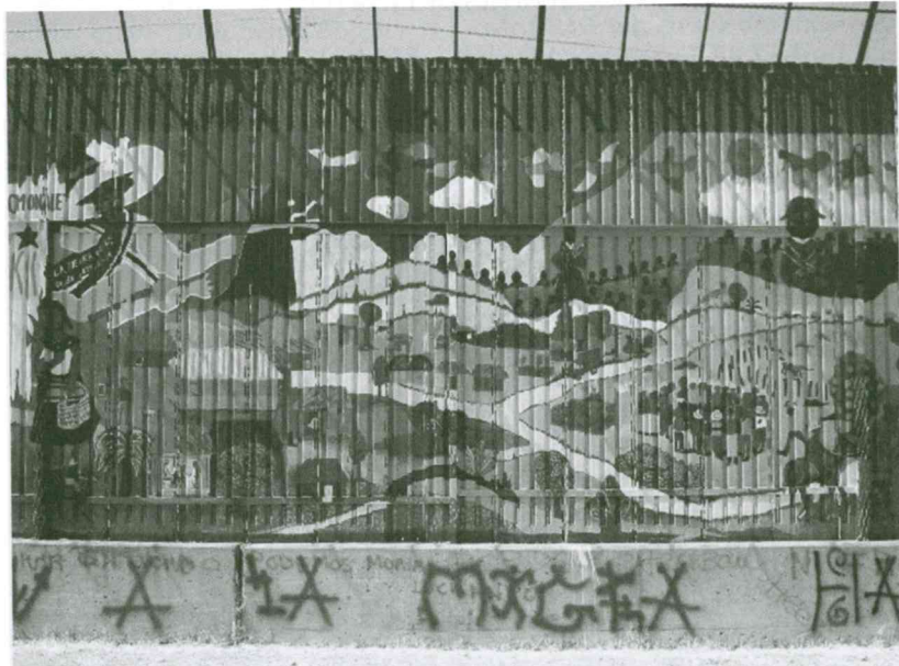
Fig. 3: "Dream of Taniperla Canyon," on the Mexican side of the U.S./Mexico Wall, Ambos Nogales, Mexico. This mural was originally painted by Zapatistas in Chiapas, Mexico. It was destroyed by paramilitary forces. Subcomandante Marcos called for it to be repainted throughout the world. It is a depiction of the indigenous communities in Chiapas being able to live in peace, after 500 years of assault by colonialism and neoliberalism.

As of this writing in the summer of 2007, national politics has ground to a halt on immigration reform, while the national government has augmented surveillance of immigrant communities and stepped up