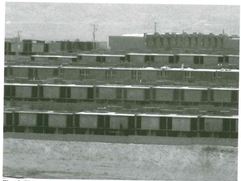
Fig. 4: “Pigeon houses” being built around manufacturing plants near Tijuana, Mexico.

We know about contemporary American slave quarters: the camps for migrant agricultural workers, the city slums that breed horizontal violence among young people, our prisons ... especially our prisons. The structure of slavery has not left our bloodstream. Like a renegade gene, it keeps replicating itself, pulling in different ethnic groups to satisfy its cancerous voraciousness for profit. Africans, Irish, Italians, Chinese, Japanese, Puerto Ricans, Dominicans, Haitians, Bangladeshis, Pakistanis, Sudanese, Mexicans. The evil triplets that Martin Luther King, Jr. warned